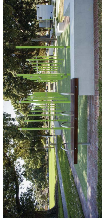
INTERACTIVE EDGE - seating and exercise opportunities