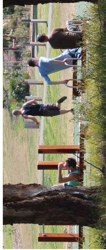
CORE & BALANCE - low intensity static equipment